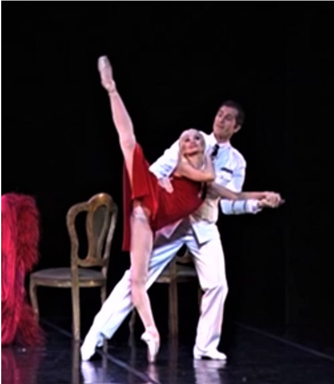
Eva meets Peron at a benefit