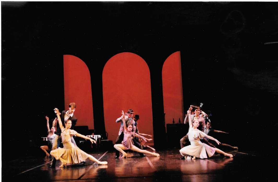
La Cumparsita at a milonga