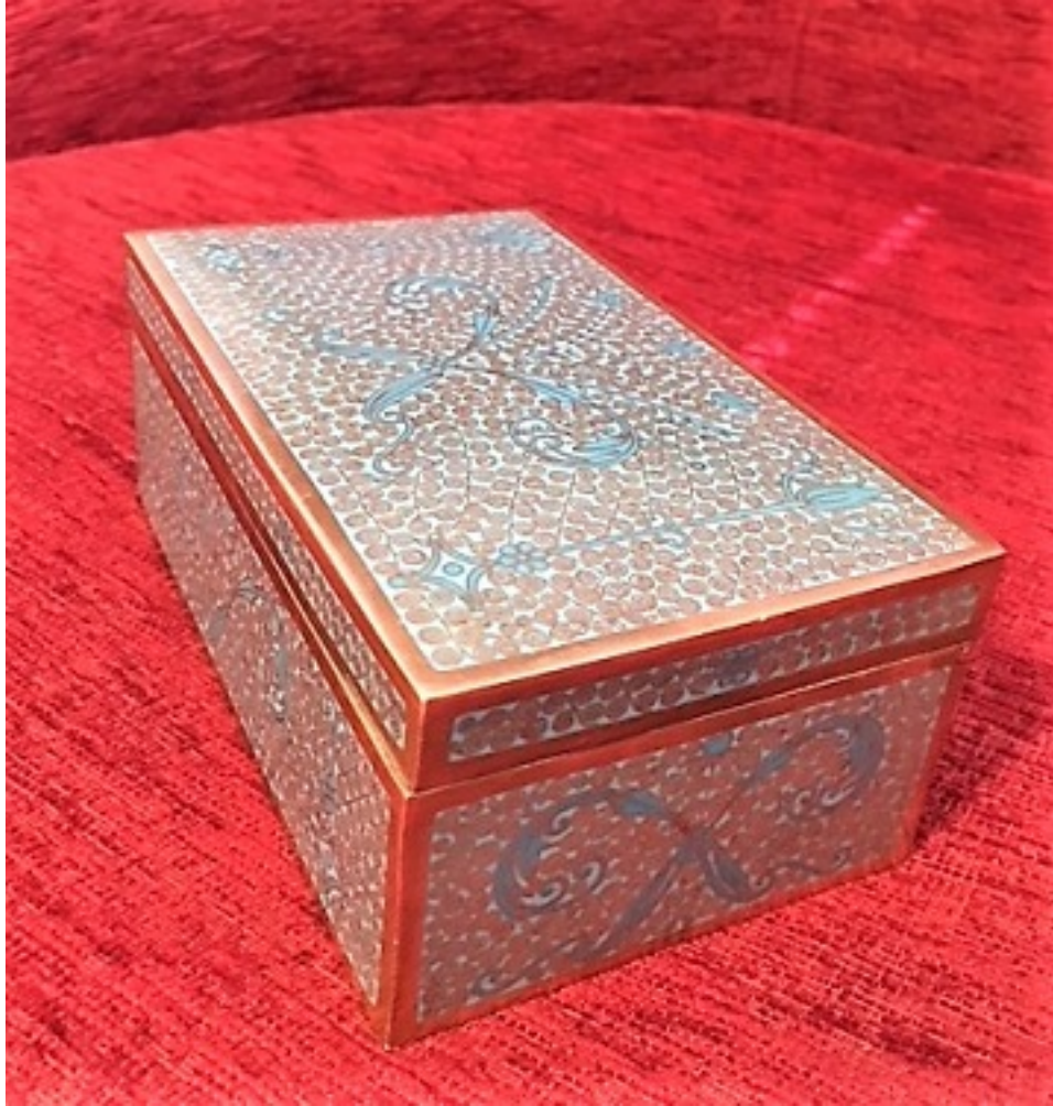
Dame Alicia Markova “Anna Pavlova box